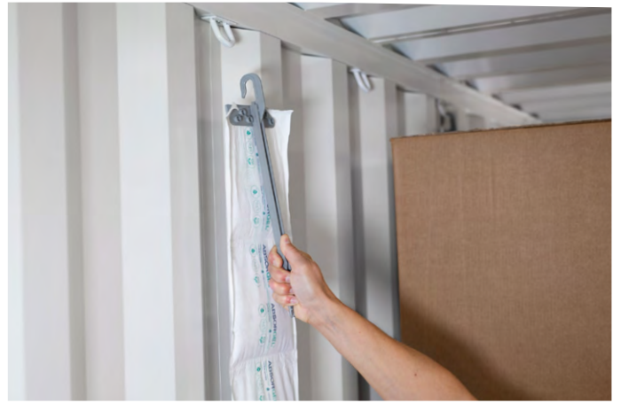
INSTALLATION USING ABSORSTICK™