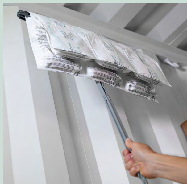
NEW ABSORGEL MAX -X IN THE CONTAINER