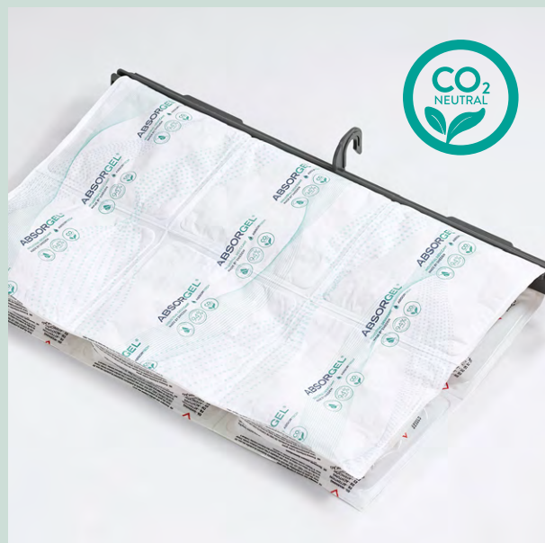
ABSORGEL® MAX ( PRODUCT PRINT CAN DIFFER)